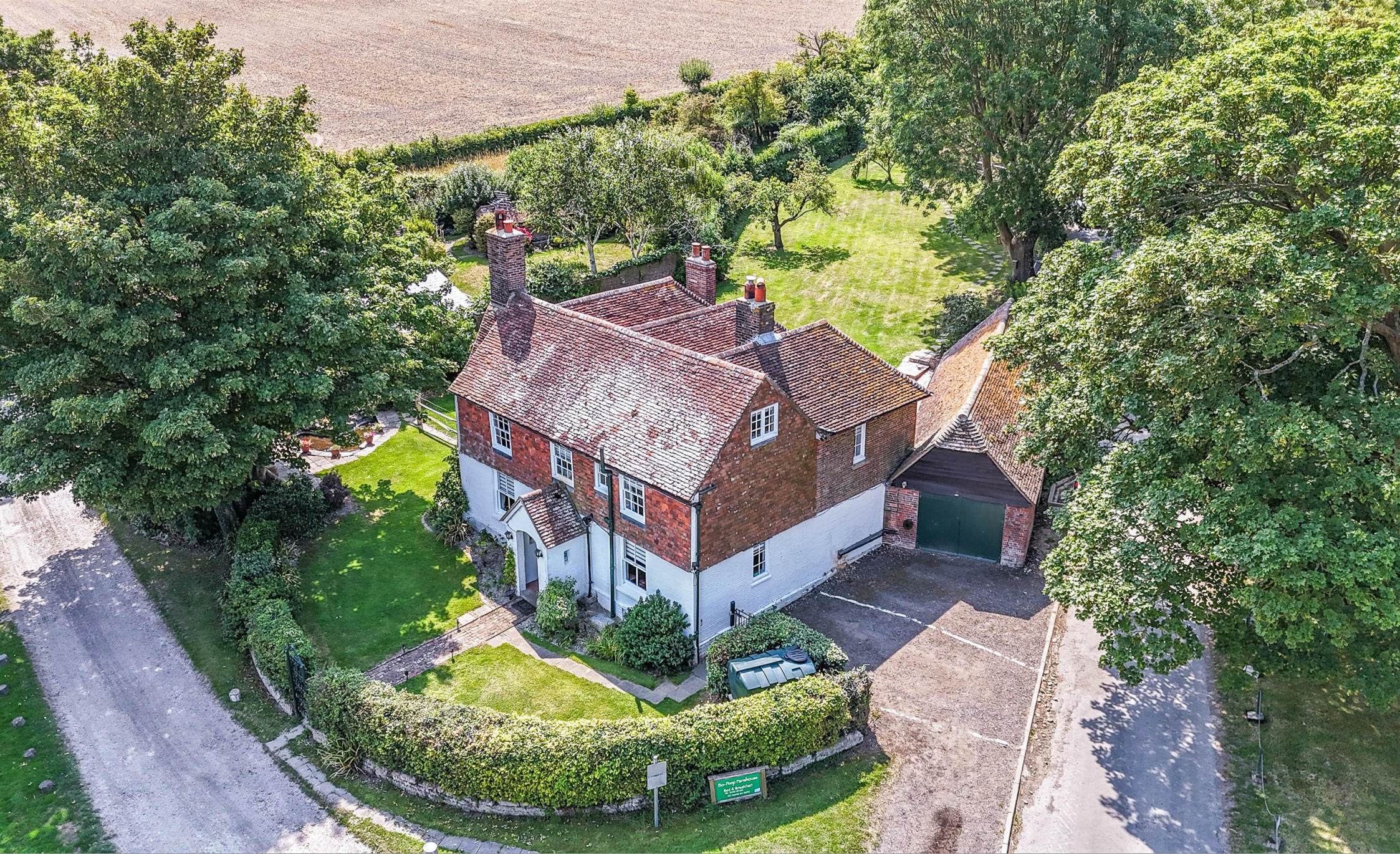
Bo-Peep Farmhouse Bo-Peep Lane, Alciston, BN26 6UJ